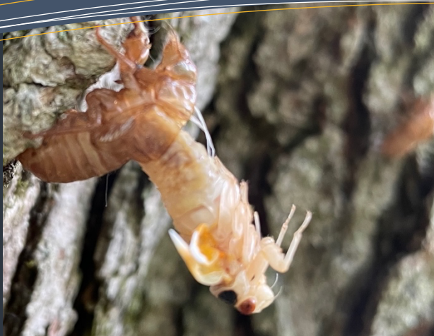
Image of cicada emerging from nymph shell

https://emerginginvestigators.org/articles/the-presence-of-em-wolbachia-em-in-brood-x-cicadas